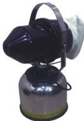
FOGGER FUMIGATOR SS938