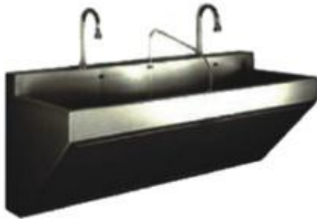
SCRUB STATION SS931