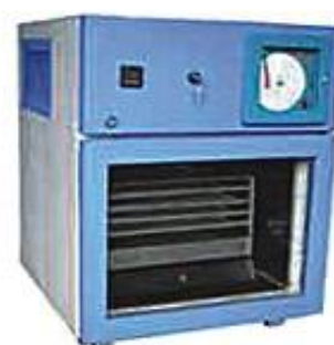
PLATELET INCUBATOR BBE117