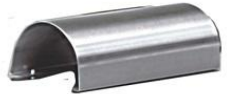
DISSECTION NECK BLOCK SS936