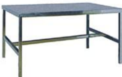
STAINLESS STEEL TABLE SS917