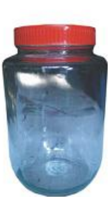
ORGAN GLASS JAR SS937