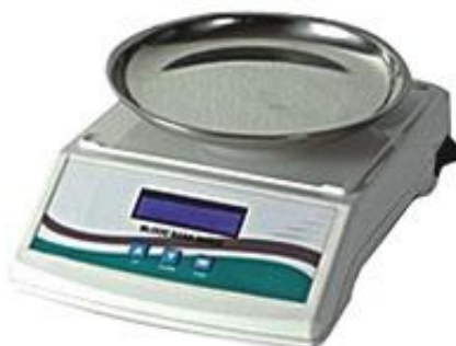
BLOOD COLLECTION SCALE BBE116