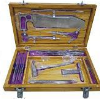
POSTMORTEM SET SS935