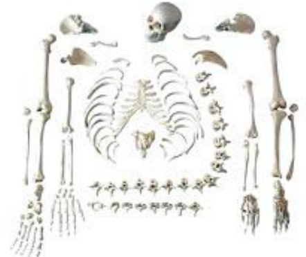
BONE SET SS940