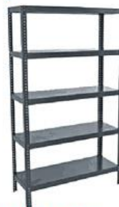
STORAGE RACK SS918