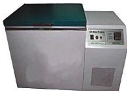
DEEP FREEZER BBE115