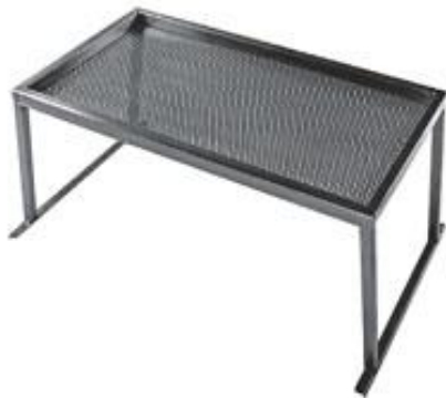
ORGAN DISSECTION TABLE SS934