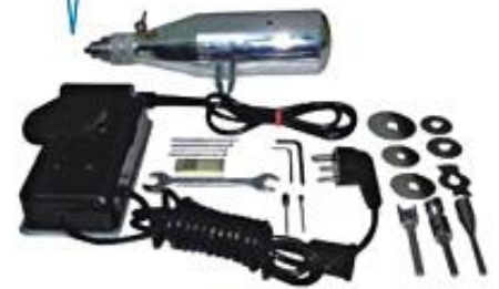
AUTOPSY SAW SS933