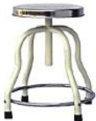
REVOLVING STOOL SS916