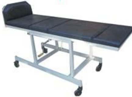
TILT TABLE SS932